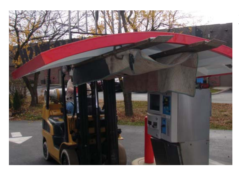
STEP 3 : Lift canopy up and line it up with canopy steel post (or posts).