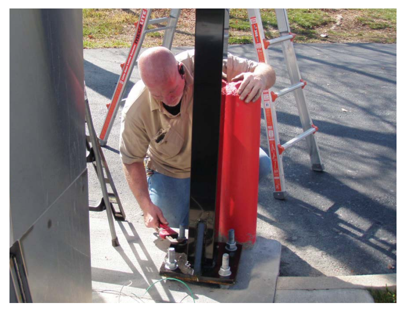
STEP 6 : You may have to shim it to make the post levelled. Once the post is levelled then tighten all bolts.