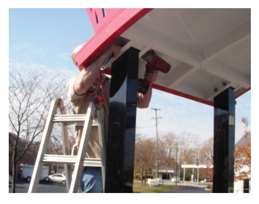
STEP 5 : Once all the bolts are in go back and tighten all them.

Don't tighten nuts in full until after canopy is fully installed to allow some movement for adjustments