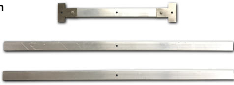
ALUMINUM BASE CROSSBAR AND LEGS