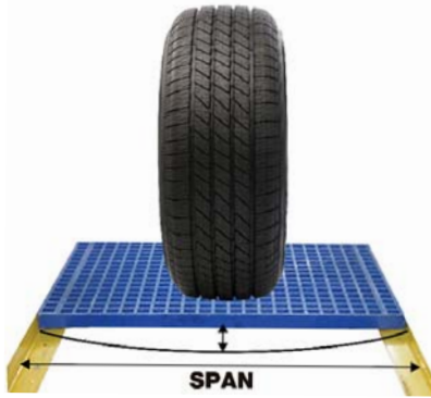
CHART BELOW SHOWS THE DEFLECTION IN INCHES AT THE CENTER POINT