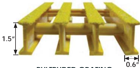
PULTRUDED GRATING 3FT X 10FT SHEET WEIGHS - 125LBS 50% OPEN AREA